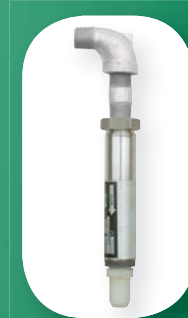
SP158A Freeze protection bleed valve