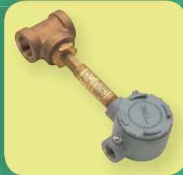
SP154 Alarm flow switch