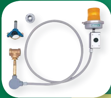
9001DPDT Double pole double throw audible alarm and light