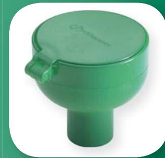
SP21FC Eye/Face Wash Head w/Flow Control • 2.5 gpm