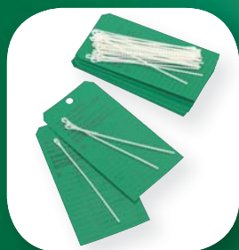
SP170 Test tags • 25 per pack