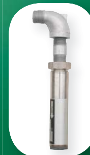
SP157A Scald protection bleed valve