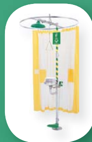
9037 Privacy curtain