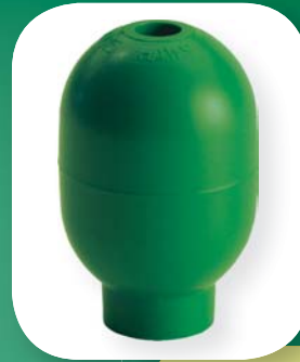
SP11FC Eyewash Head w/Flow Control • 1.25 gpm