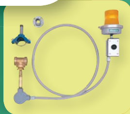
9001 Audible alarm and light