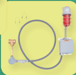
9001EXP Explosion proof audible alarm and light