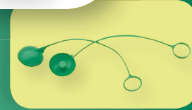
9095 Dust covers