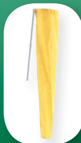
9010 Test kit