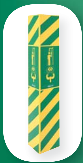
9020 Large combination shower & eyewash sign